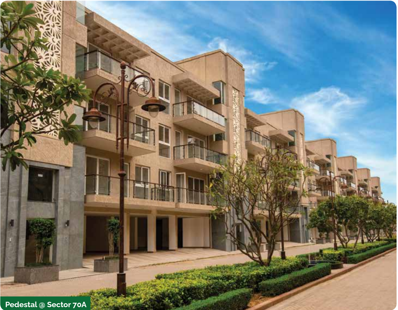
Actual Project Images

Bringing the best of past years, we have already established ourselves as the pioneers of a lifestyle that allows luxury living at an affordable price. BPTP's Amstoria and Astaire Gardens are the perfect examples of integrated luxury townships in Gurugram.