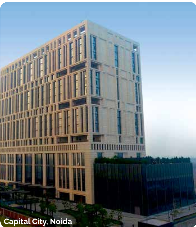
Capital City, Noida

Over the past 15 years, with the launch of its flagship project "Parklands" in Faridabad and integrated luxury townships in Gurugram, BPTP has created a range of sustainable and recognized developments, such as Amstoria, Astaire Gardens, Discovery park, Pride, Visionnaire Villas, Pedestal @70A, Spacio, Terra, amongst many others.