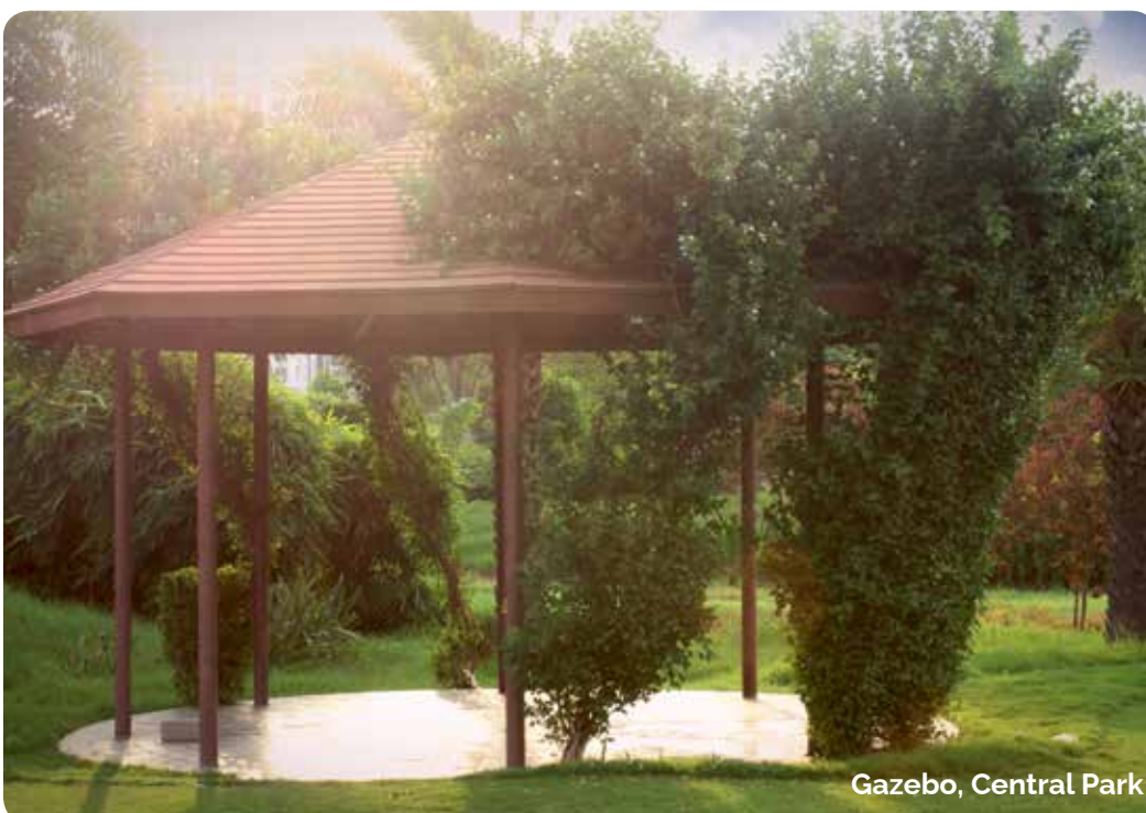
Gazebo, Central Park