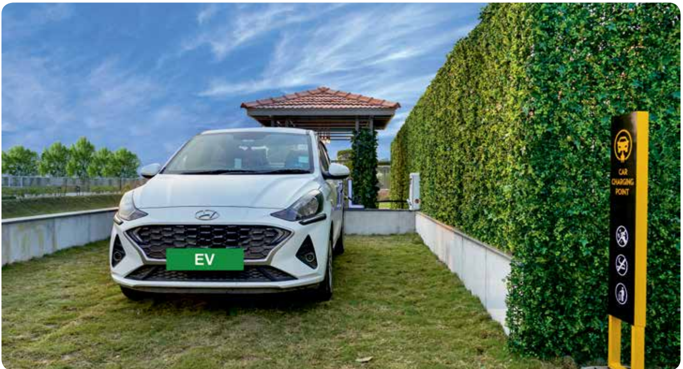
Actual Project Image

Breathe easy and soak in the freshness; cherish the inspiring view of life along an expansive Central Park with abundant foliage, landscaped greens & water bodies. Feel the comfort of living in an environment that offers abundant facilities for your family to grow.