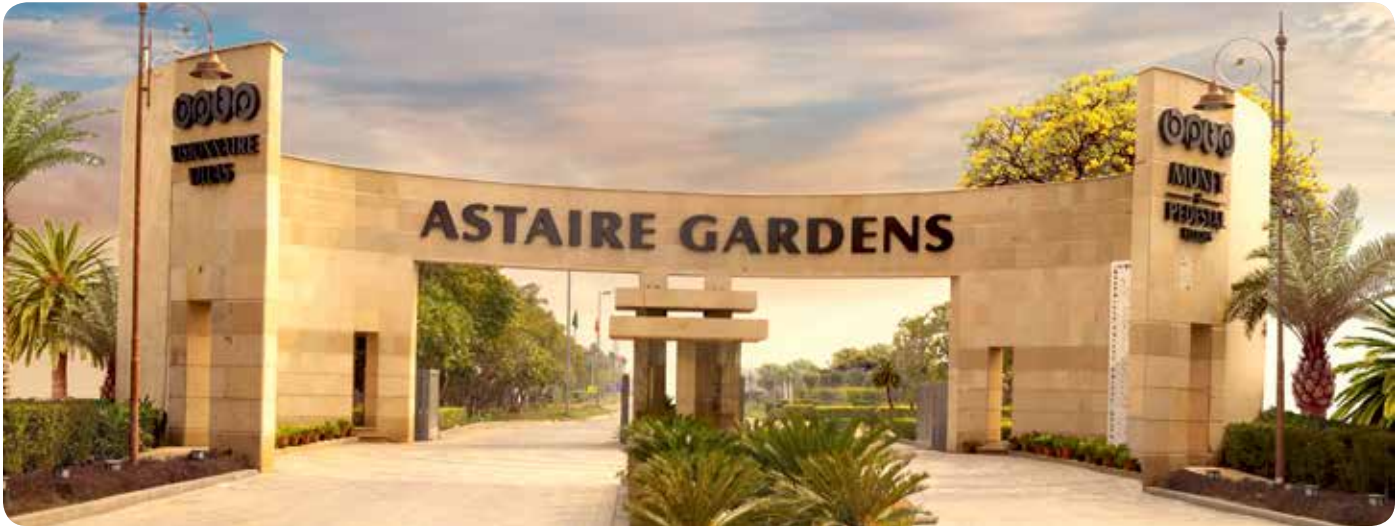
Actual Project Image