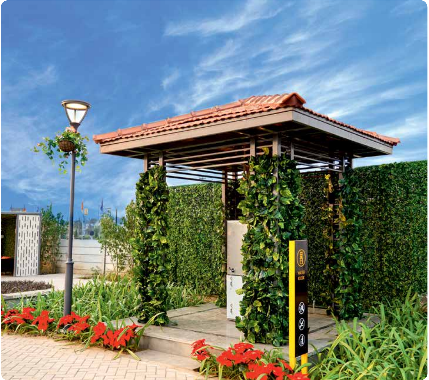
Actual Project Image

Bringing the best of past years, we have already established ourselves as the pioneers of a lifestyle that allows luxury living at an affordable price. BPTP's Amstoria and Astaire Gardens are the perfect examples of integrated luxury townships in Gurugram.