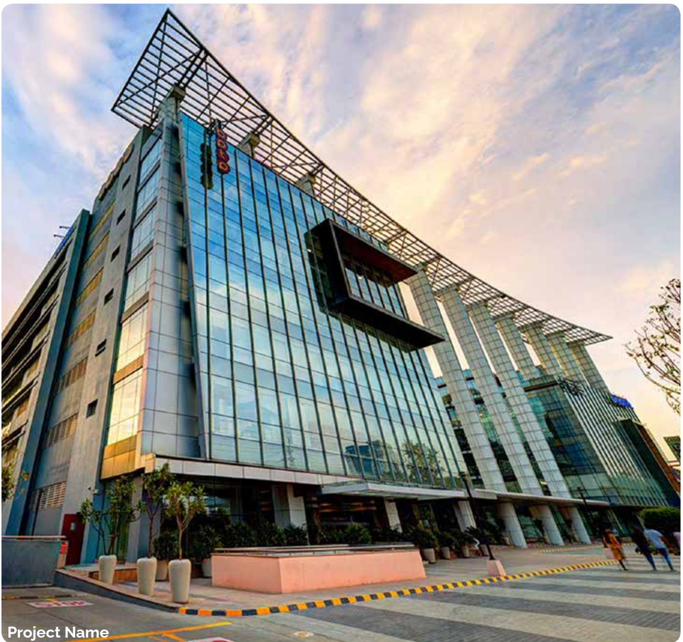
Actual Project Image