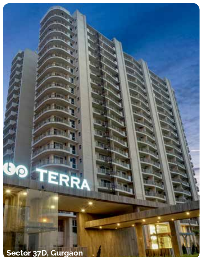
Sector 37D, Gurgaon