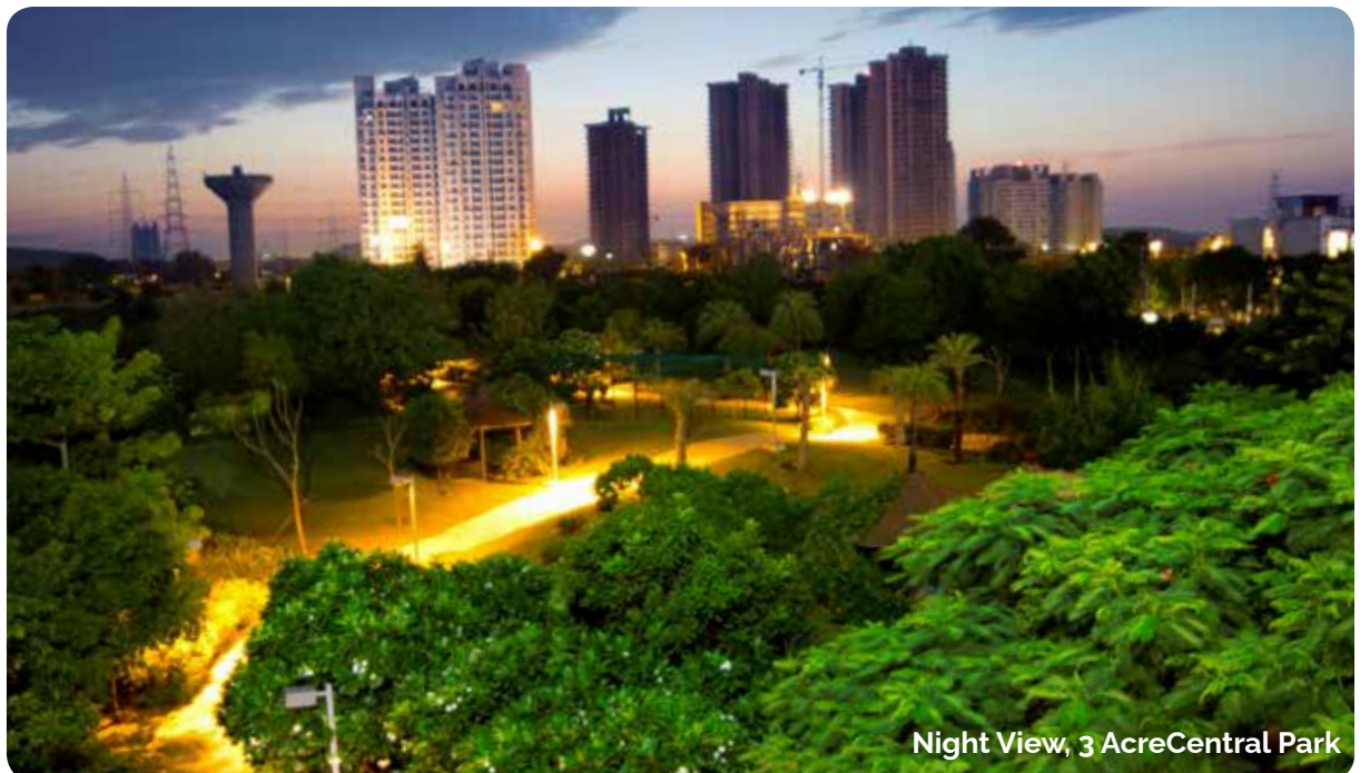
Night View, 3 Acre Central Park

BPTP's Green Oaks is a secure gated development strategically located in sector 70A, Gurugram. Spanning across 15 Acres and adjoining a 3 Acre central park, the plotted township offers a lifestyle completely immersed in nature and brings you the opportunity to build your dream home in your very own private oasis.