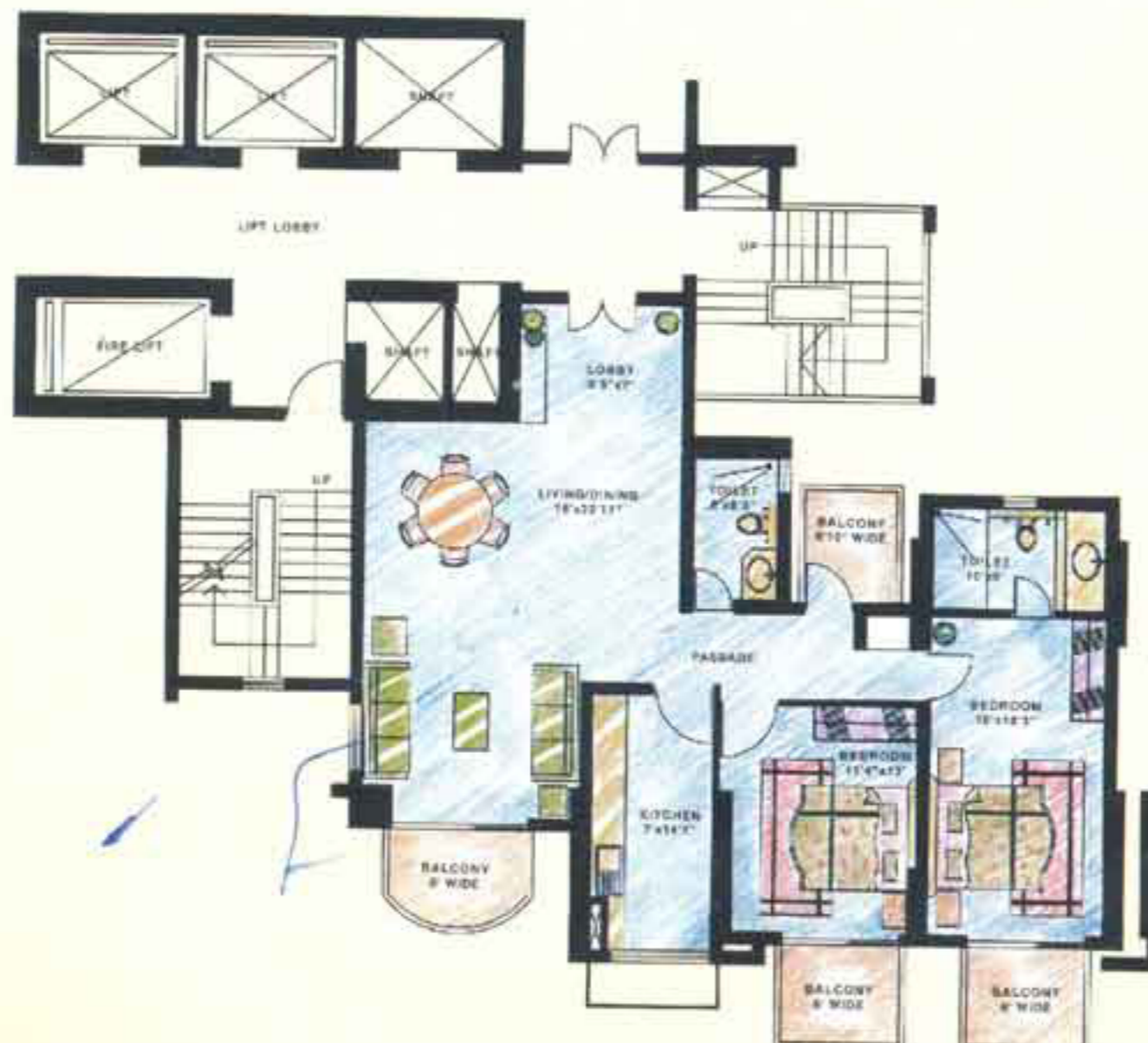
UNIT 4: ACCOMMODATION: Living-Dining, 2 Bedrooms, Kitchen, 2 Toilets and Balconies. AREA: 1436 sq.ft.