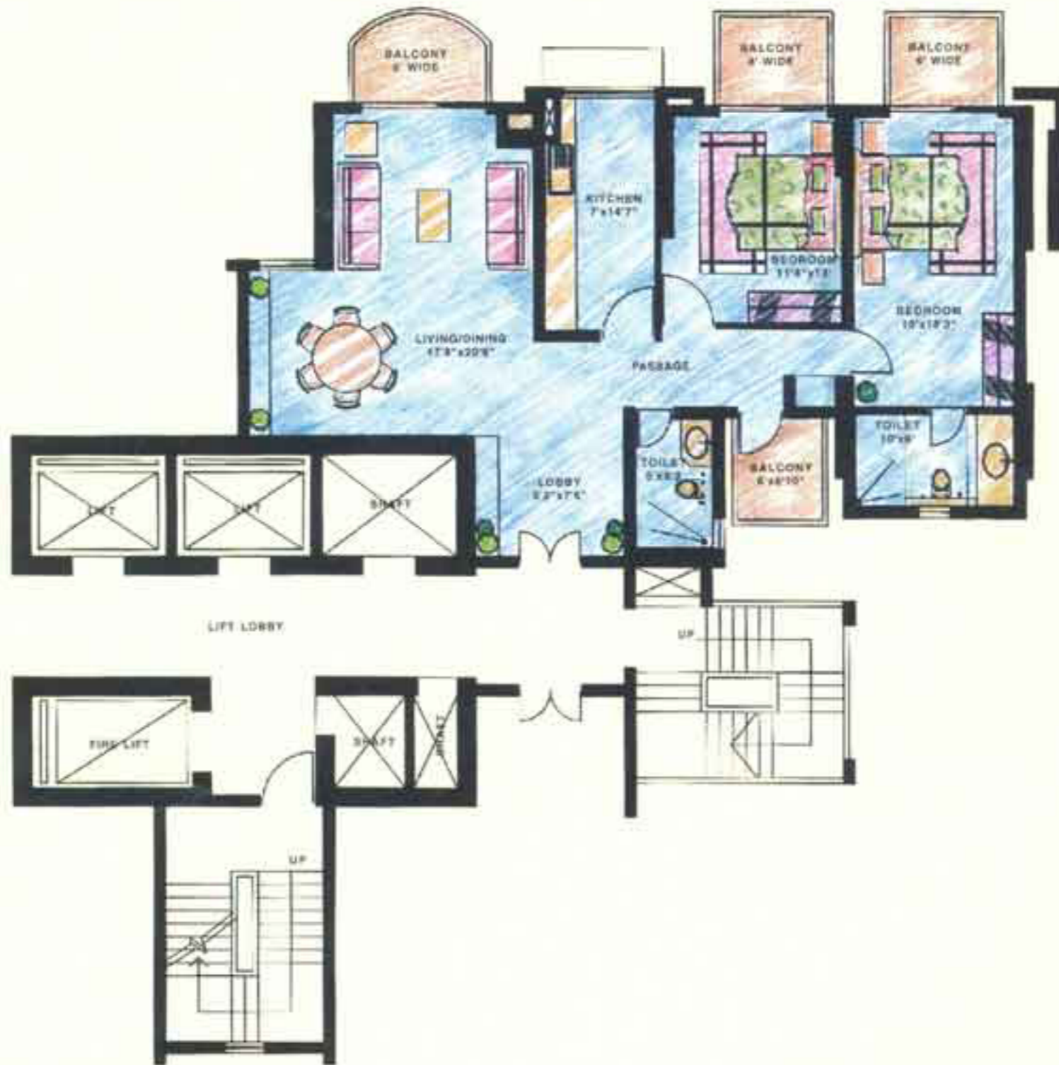
UNIT 3: ACCOMMODATION: Living-Dining, 2 Bedrooms, Kitchen, 2 Toilets and Balconies. AREA: 1417 sq.ft.