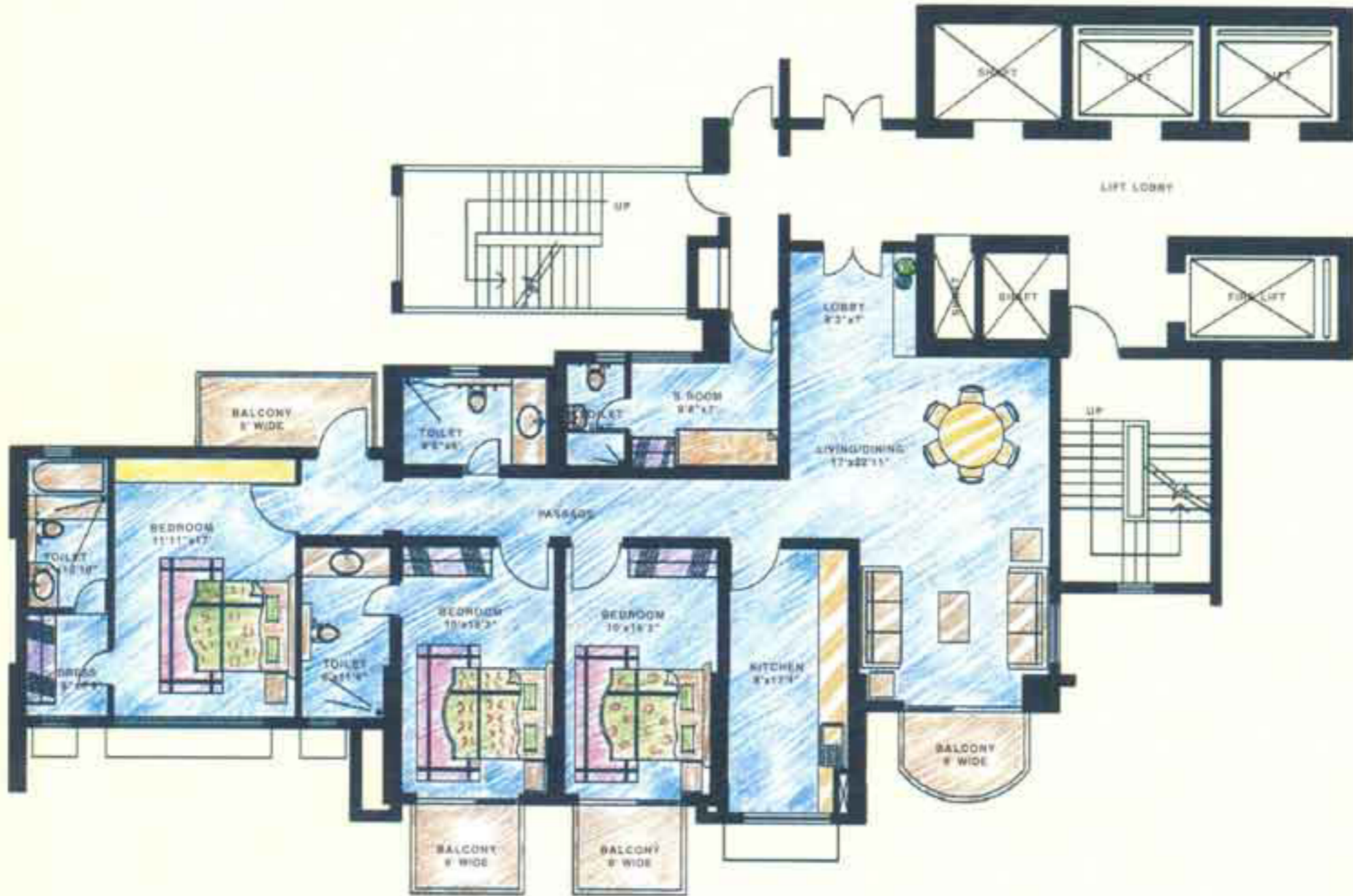
UNIT 5: ACCOMMODATION: Living-Dining, 3+1 Bedrooms, Kitchen, 4 Toilets, Balconies. AREA: 2073 sq.ft.