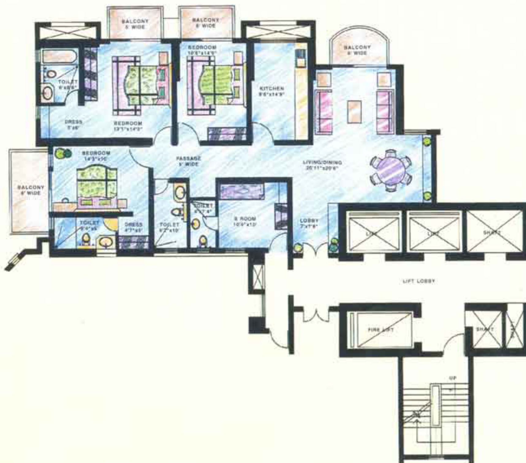
UNIT 2 & 7: ACCOMMODATION: Living-Dining, 3+1 Bedrooms, Kitchen, 4 Toilets and Balconies. AREA: 2020 sq.ft.