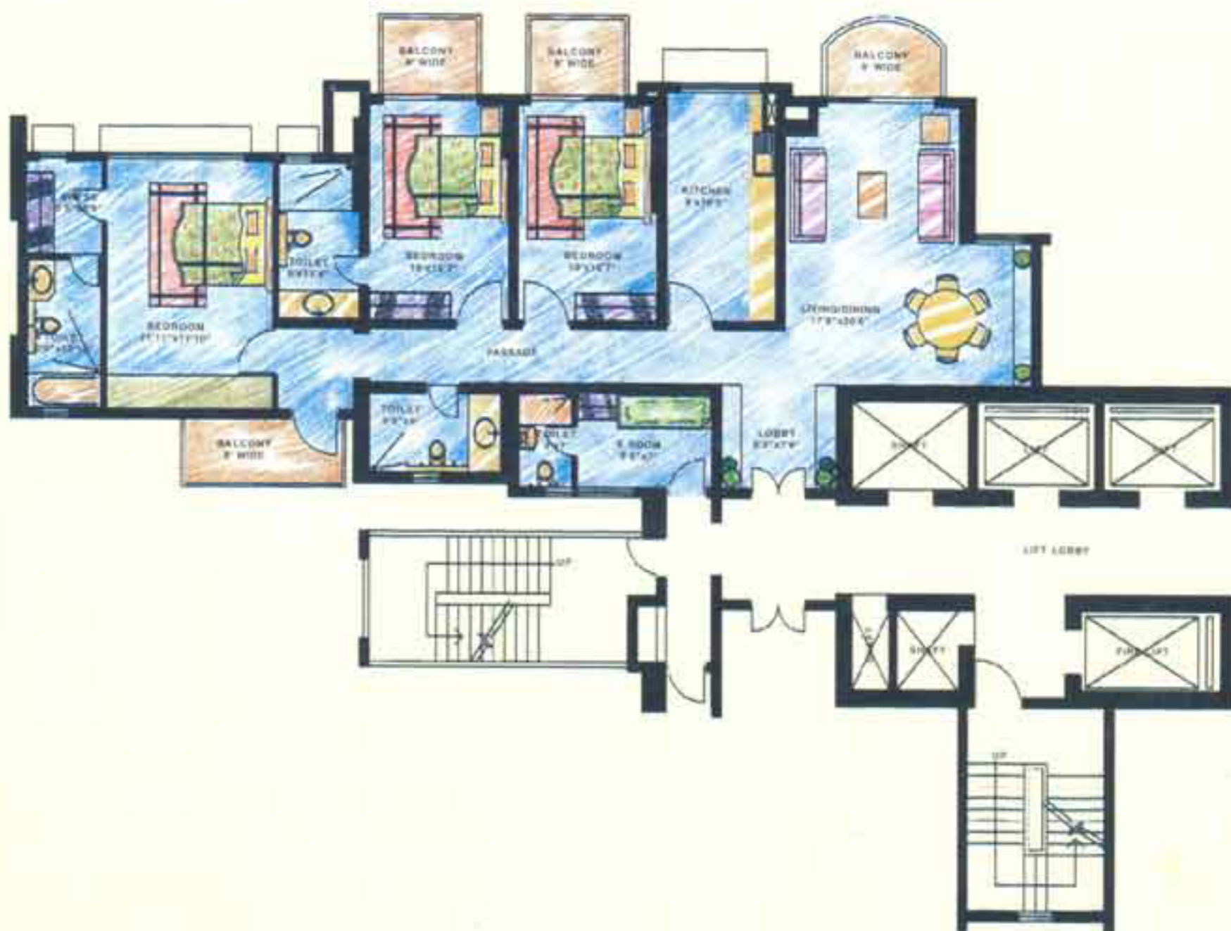
UNIT 6: ACCOMMODATION: Living-Dining, 3+1 Bedrooms, Kitchen, 4 Toilets and Balconies. AREA: 2045 sq.ft.